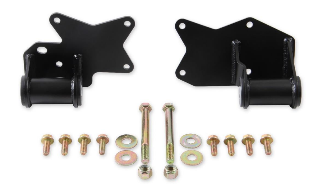
Click here for a direct link to the product webpage

These Hooker BlackHeart engine swap mounts are one part of a fully engineered Swap System for the 1973-1976 Mopar A-Body. Each part of the swap system is designed to work together as a complete system along with the other components for an easy bolt-in installation.